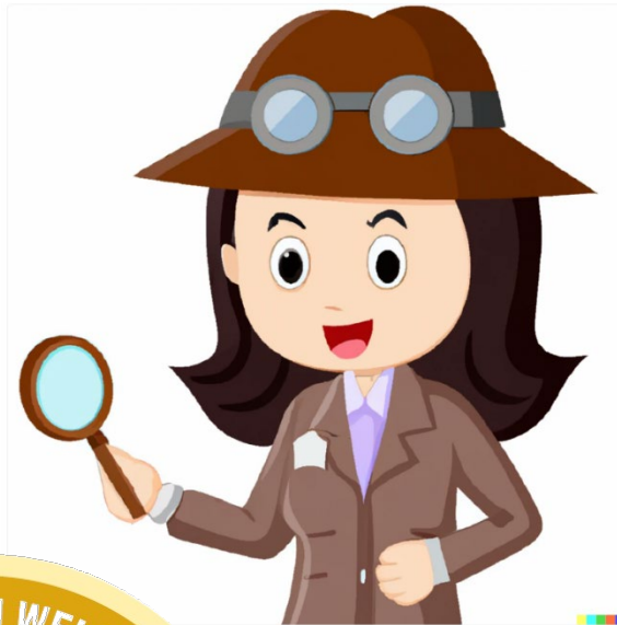
Cartoon Fraud Investigator as drawn by Artificial Intelligence

For in the land of food and treats so grand, Justice prevails, under its command. No fraudster can hide, no matter how shrewd, For in the end, truth will be pursued.